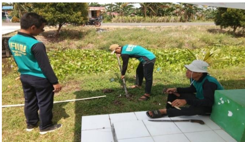
Figure 5 Cleaning Weeds

The students undertook activities such as sweeping the park, arranging plants, removing weeds and dead branches, and maintaining the plants.