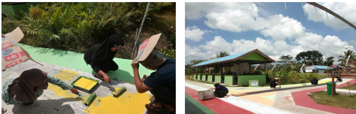
Figure 7. Creation gallery Painting

IAIN Palangka Raya service KKN students painted the Bangun Harja agrotourism park to make it look more beautiful and attractive. This process starts from making paths and identifying places that need painting, mixing the paint with a special mixture until it is even, dividing the painting tasks so they can be finished quickly, then painting.