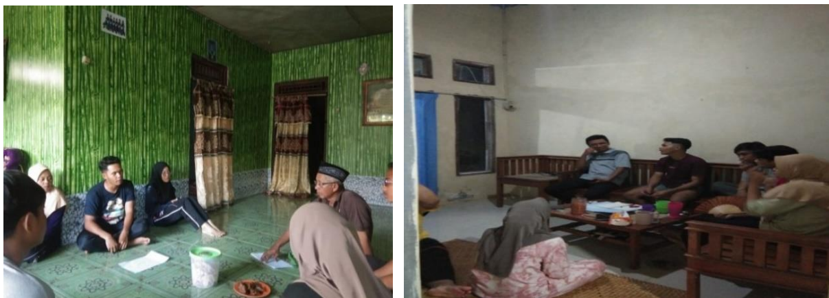
Figure 3. Activity planning with village officials, community leaders, and needs planning briefing

Through these design steps, the IAIN Palangka Raya community service students aim to create a well-planned and attractive agro-tourism park. Their efforts focus on enhancing the physical environment, ensuring the availability of necessary resources, creating engaging attractions, and leveraging social media for promotion. By carefully designing each aspect of the park, they hope to develop a sustainable and popular destination that will benefit the community economically and socially.