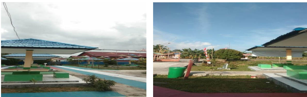
Figure 2. There is wild grass, less fertile plants, scattered rubbish

The findings from this initial discovery phase formed the foundation for subsequent efforts to enhance and promote the agro-tourism park. By leveraging social media, the students aimed to raise awareness, increase visitor numbers, and ultimately improve the economic and social wellbeing of the Bangun Harja community. Through collaboration with local residents and authorities, the project sought to create a sustainable model for community development, utilizing the village's assets effectively for long-term benefits.