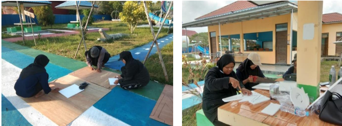
Figure 6. Spot design creation gallery

IAIN Palangka Raya service students design and create interesting spots to attract the interest of the surrounding community, both from within the village and outside the village.