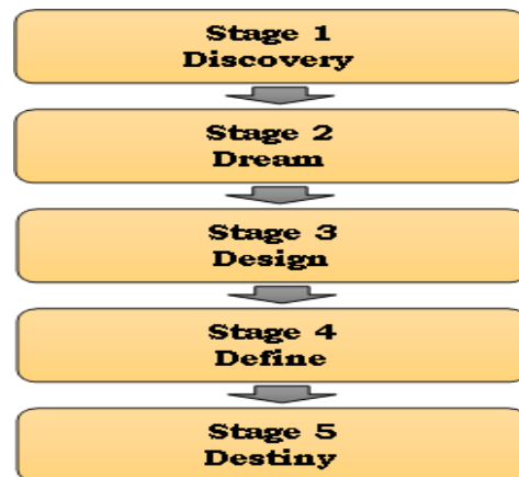
Figure 1. Activity stages.

social media), and physical assets (Bangun Harja Agrotourism Park). The stages in the development and promotion of the Bangun Harja Village agrotourism park through social media are illustrated in the diagram in Figure 1 below.