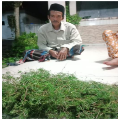
Figure 3. The morphology of Kamandin Saebo plants

The research team conducted a literature search and obtained information that, through morphological characterization, Kamandin Saebo was a species of Glossocardia leschenaultii (Cass.) Veldkamp. The morphology of Kamandin Saebo based on the research team's findings from one of the herbal medicine makers is as shown in Figure 3. Meanwhile, the only information regarding the complete morphology of this plant can be found in previous research publications (Hariri et al., 2021), as in Figure 4.