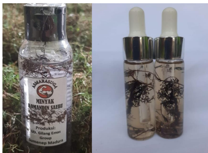
Figure 5. One of the traditionally sold Kamandin Saebo oil products (Collection of Mr. Abdus Shamad, Sumenep).

Based on the observations, it was found that the form of the Kamandin Saebo ingredients which are traded traditionally in the Madurese community are simplicia, liquid (as balur oil or massage oil, which is mixed with oil or in other ingredients there are lots of other spices mixed in), and ingredients in the form of powder, consisting of a mixture of several medicinal plants. One form of potion (type of oil) that is sold traditionally is as presented in Figure 5.