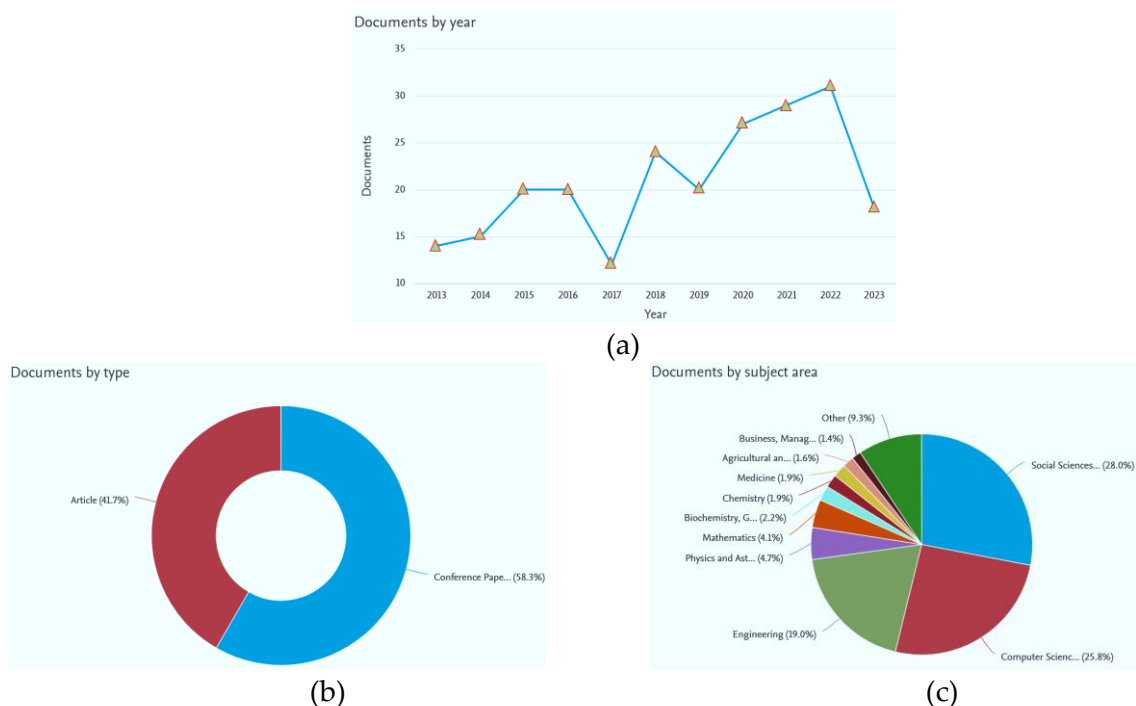
Figure 3. Document screening results based on: (a) last 10 years (2013-2023), (b) type (article and conference paper), and (c) all subject areas.

The data shown in Figure 2 reveals that a total of 368 documents were found through keyword-based searches from 1993 to 2024. These documents can be categorized into different types, with articles making up 37%, conference papers comprising 51.9%, book chapters accounting for 4.9%, conference reviews making up 2.4%, and miscellaneous categories such as reviews, books, erratum, notes, and short survey. In terms of subject areas, the identified documents cover a wide range of disciplines, with 25.1% in social science, 26.7% in computer science, 20.3% in engineering, 4.2% in mathematics, and the rest from various other fields.